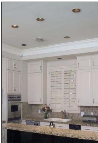
Go from this...