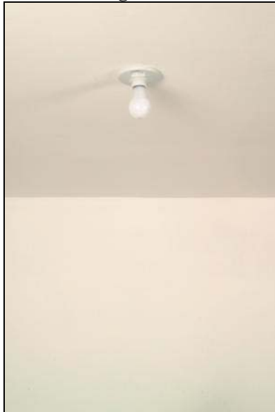
Standard Light – Before